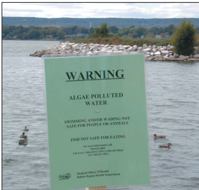
Toxic blue-green algae bloom in Hamilton Harbour, Ontario, August 2001.