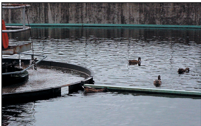
Municipal wastewater effluents are composed of suspended solids, human waste, debris and chemicals from residential, industrial and commercial sources.