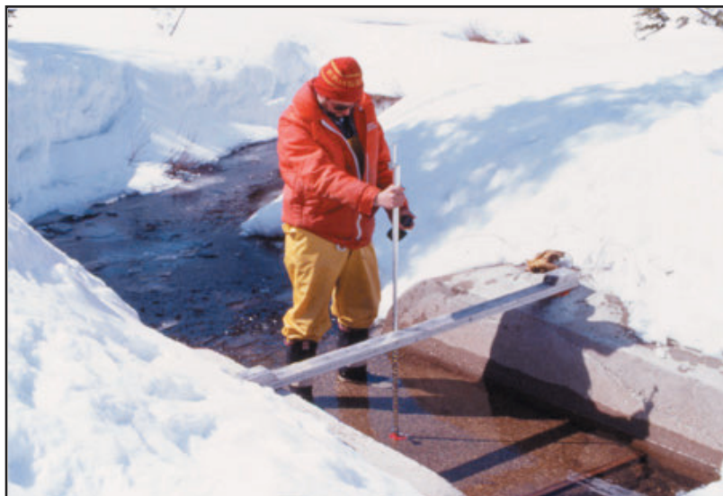
Sampling to quantify stream chemistry.