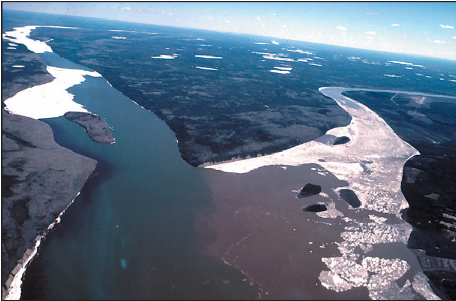
Ice breakup on the Mackenzie and Liard rivers: historical sources show earlier ice breakup and later freezing dates on lakes and rivers in recent years.