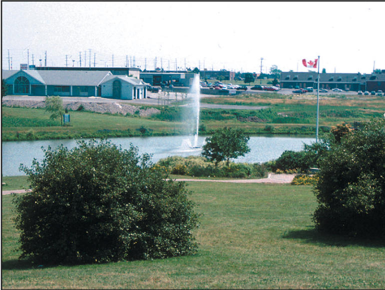
Flooding and erosion impacts of urban runoff can be lessened by effective stormwater management.