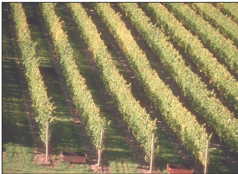
Large-scale field trials are needed to determine the impacts of genetically modified organisms in agriculture and silviculture.

or invent new animals, potential pain and distress in animals used as "production vessels," attempted patenting in the U.S.A. of a cell line developed from human blood, etc.).